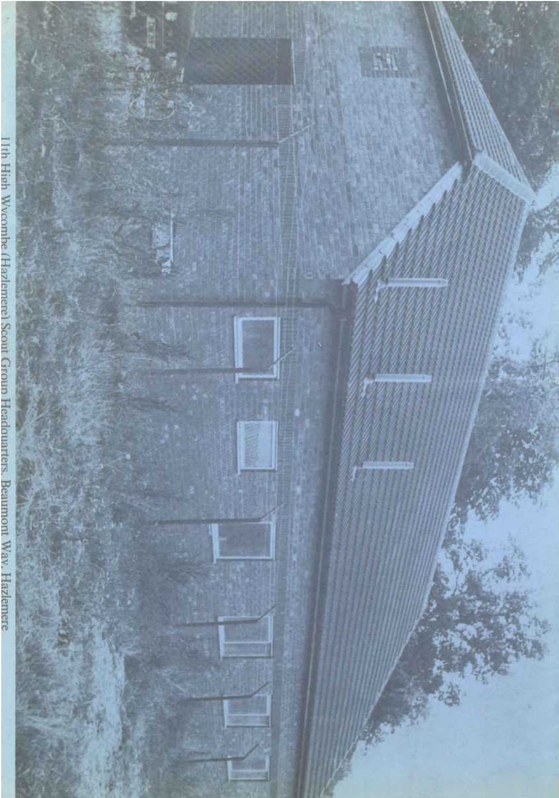
11th High Wycombe (Hazlemere) Scout Group Headquarters, Beaumont Way, Hazlemere